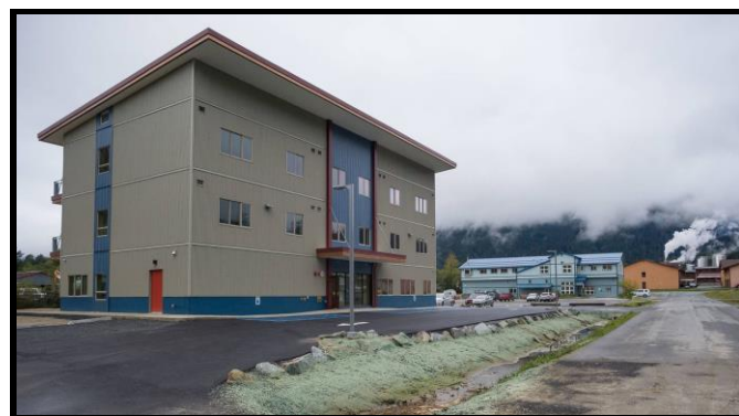
Juneau's Forget-Me-Not Manor is one of four Housing First projects in Alaska. The other three are in Anchorage and Fairbanks.