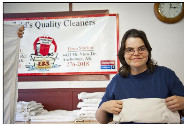
A worker at Mayfield's Quality Cleaners in Anchorage folds laundry at her day job.

Employment for people with disabilities is associated with better health and lower public costs. A 2013 University of Kansas study found that “participants with any level of paid employment had significantly lower rates of smoking and better quality of life; self-reported health status was significantly higher; (and) per person per